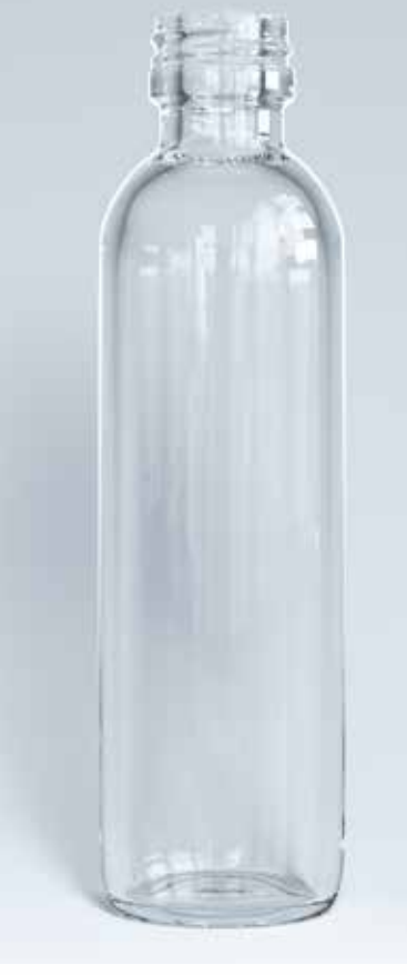
| 4 cl Krugflasche ○ | H: 112,5 PP 18 | Ø: 31,2