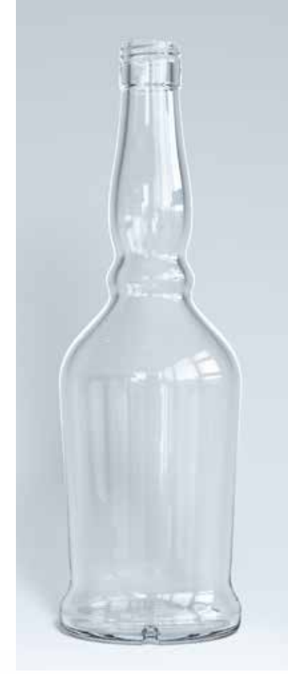
70 cl Ecossaise O H: 285 BVP 31,5 Ø: 87,9