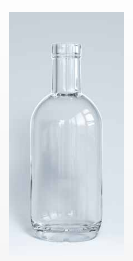
35 cl Moonea O H: 190,8 Cor Int. finish Ø: 18,5