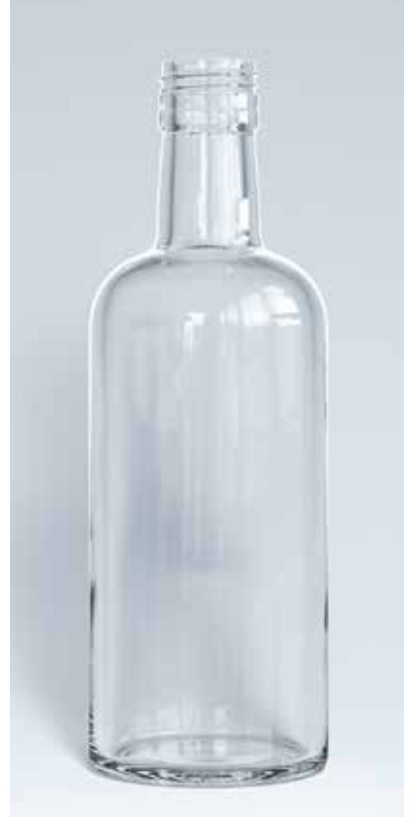
50 cl Terra O H: 215,4 PP 31,5 D Ø: 73,3