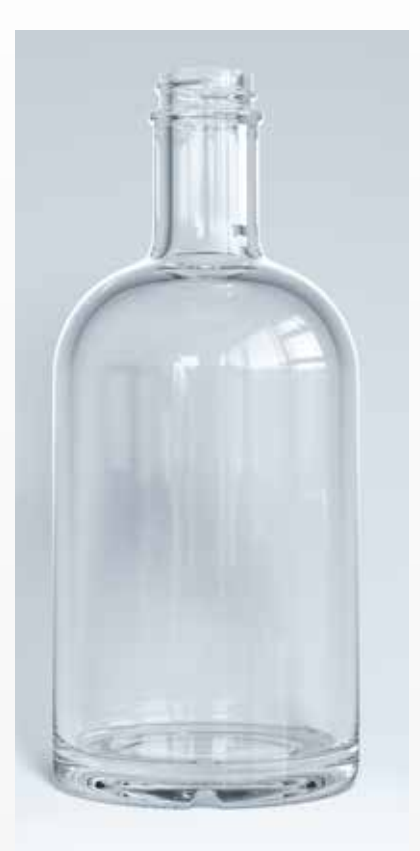
50 cl Tortuga 🔾 H: 191 Ø: 82,5