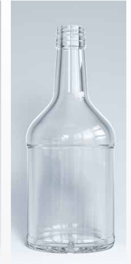
70 cl Whisky Bauch ○ H: 225,5 PP 31,5 D Ø: 89,8