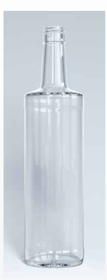
100 cl Gama 🔘 H: 320 PP 31,5 D Ø: 80,8