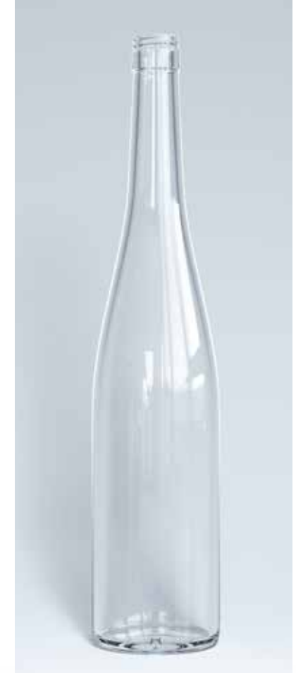
70 cl Schlegelflasche Hock ○ H: 350 BVP 30 Ø: 74,8