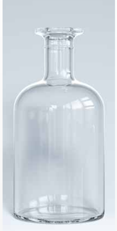
4 cl Apotheker 🔾 Int. finish Ø: 10,2