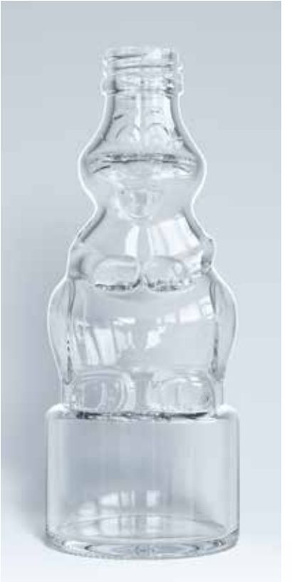
20 cl Osterhase ○ H: 166 PP 28 Ø: 66