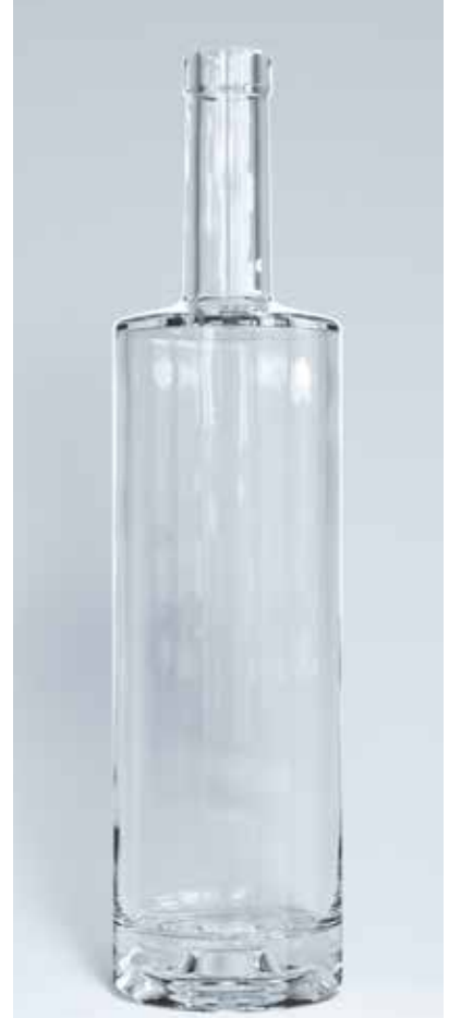
| 70 cl Atlanta ○ | H: 313,6 | Cork | Ø: 75,6 | Int. finish Ø: 18,5

70 cl Gaasch No 1 ○ H: 314,2 BVP 31,5 Ø: 66,4