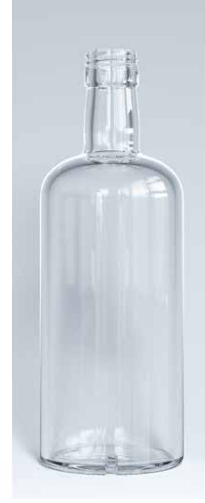
70 cl Terra O H: 237,4 Ø: 81,9