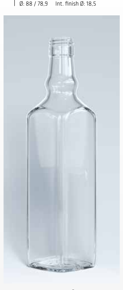
70 cl Liquer Square ○ H: 272 BVP 31,5 Ø: 69,3