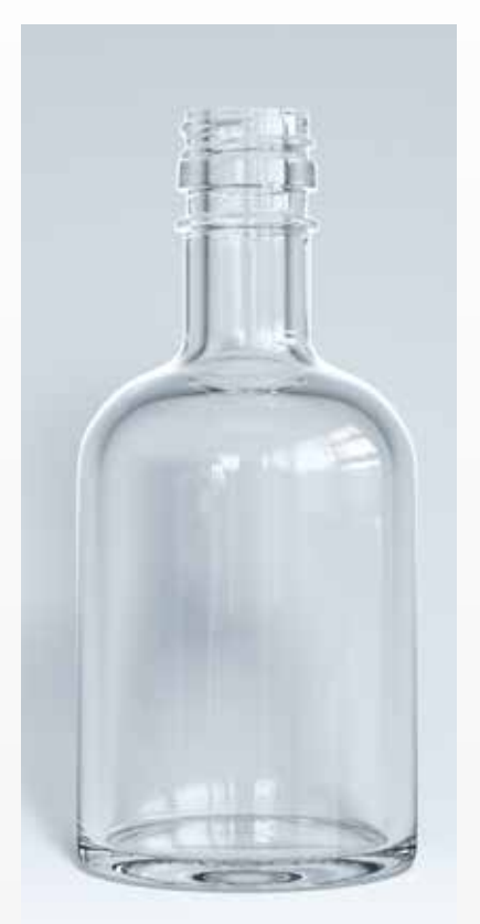
4 cl Apoteker O H: 96,4 PP 1 Ø: 43