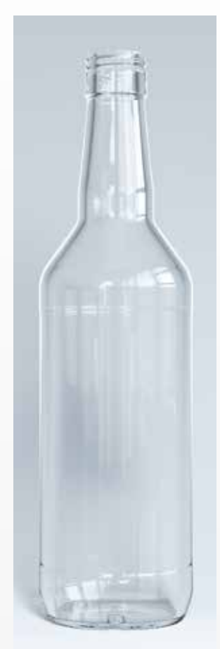
70 cl Anglais Evolucon ○ H: 276,2 BVP 31,5 Ø: 75,2