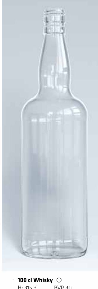
100 cl Whisky O H: 315,3 BVP Ø: 86,2 BVP 30