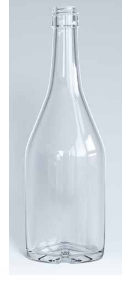
| 70 cl Normande ○ | H: 268,8 BVP 30 | Ø: 86,3