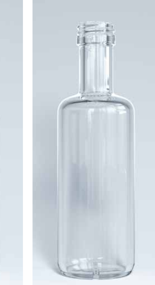
5 cl Oxygen ○ H: 117,4 BVP 18 Ø: 35,7