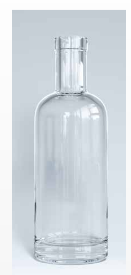
50 cl Bot. Aspect O H: 223,4 Cork Int. finish Ø: 21,5