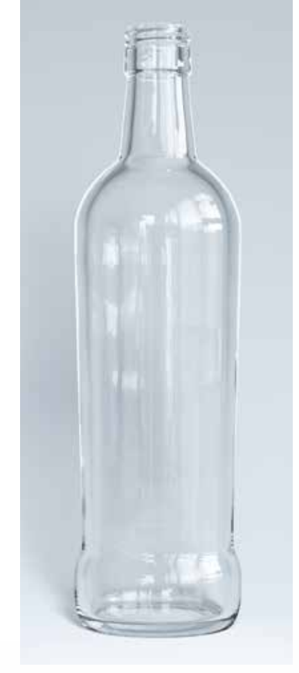
70 cl Carmabola ○ H: 270,7 PP 31,5 D Ø: 75,4