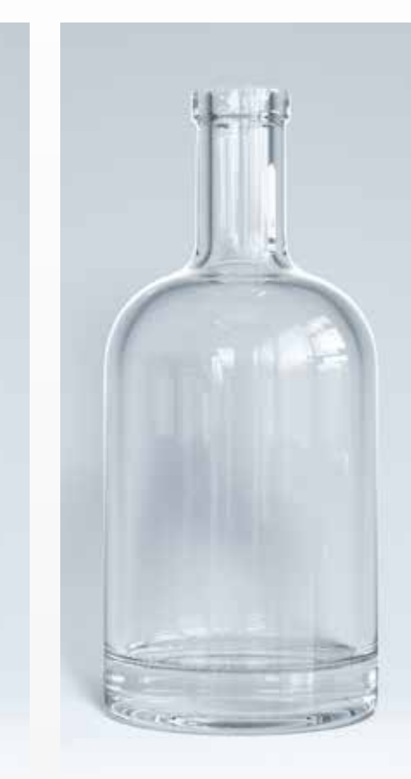
50 cl ice ○ Cork H: 193,5 Int. fin ß :18 Ø : 18,5