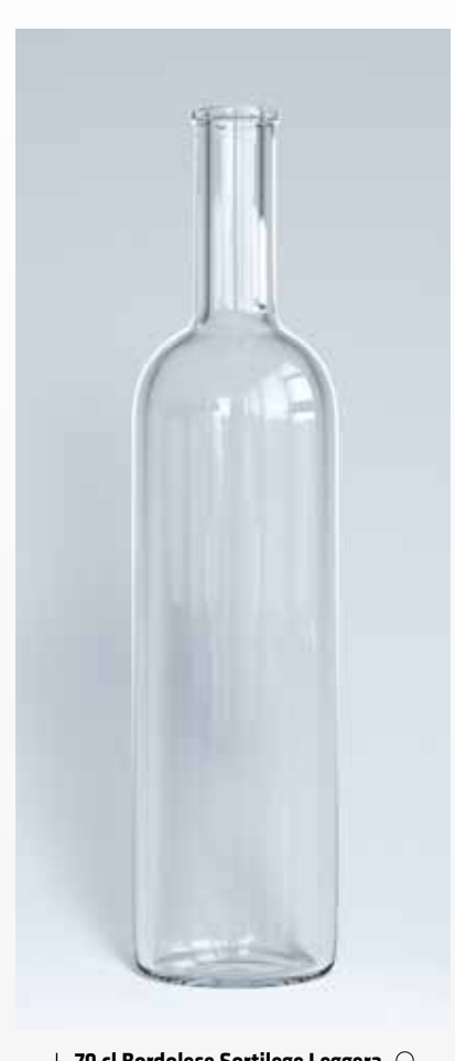
70 cl Bordolese Sortilege Leggera ○ H: 298 Cork Ø: 71,6 Int. finish Ø: 18