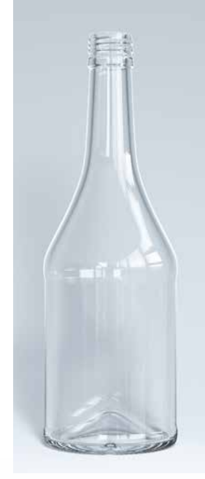
70 cl Napolion ○ H: 268 PP 31,5 D Ø: 87,8