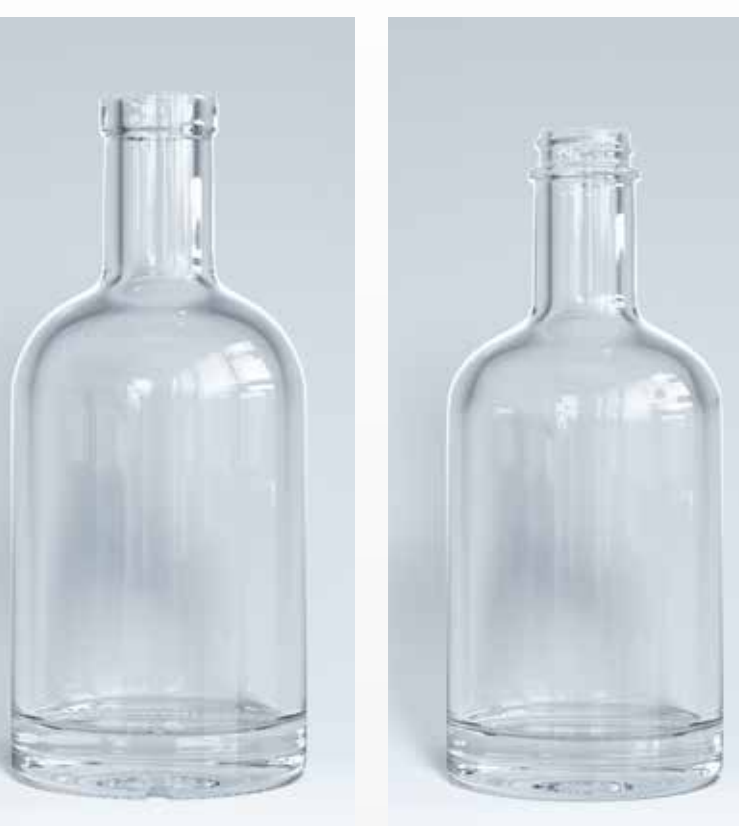
35 cl Ice O H: 173,5 Int. finish Ø: 18,5