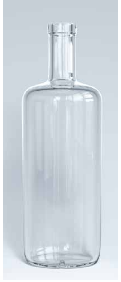
100 cl Oxygen O H: 280,6 Cork Cork Ø: 94,3 Int. finish Ø: 21,5