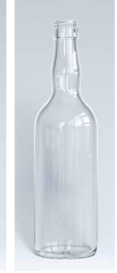
100 cl Vermouth O H: 320 Ø: 81,5 PP 31,5 D