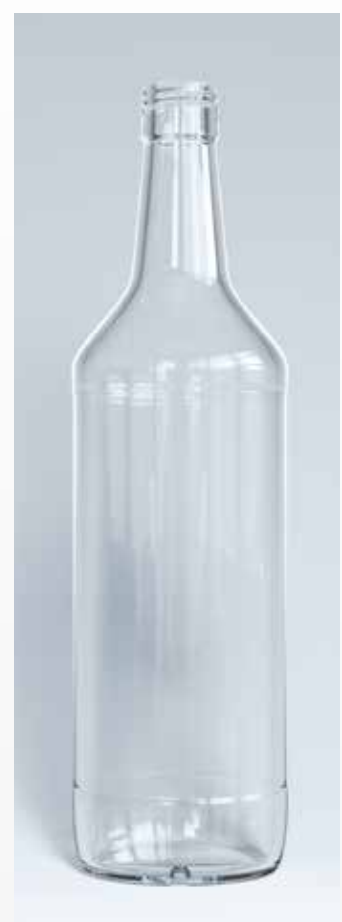
100 cl VDN All H: 307 BVP 31,5 Ø: 84