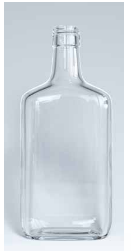
70 cl Amar. Extral O H: 229,3 PP 31,5 D Ø: 98,8 / 60