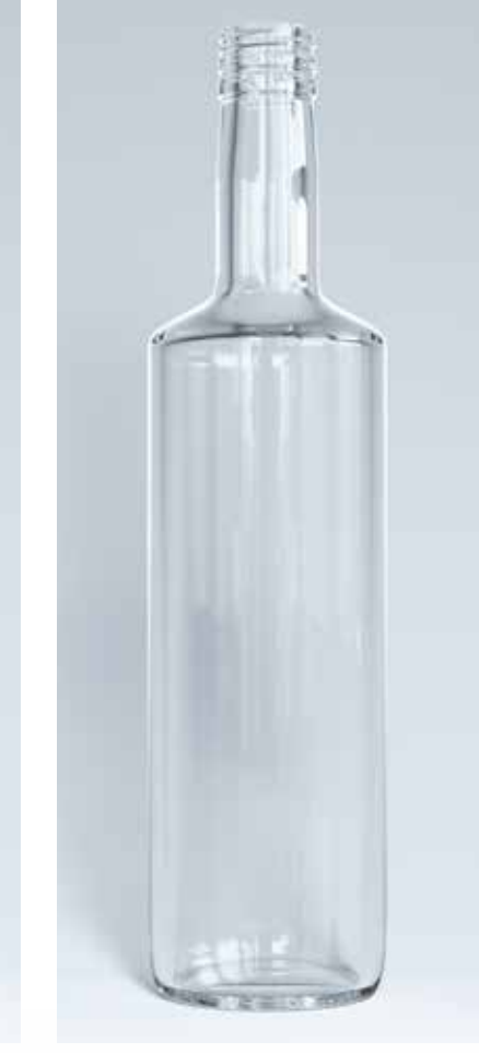
70 cl Stentino ○ H: 295,8 BVP 31,5 Ø: 72,5