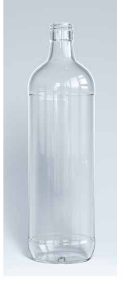
100 cl Krug \, \bigcirc \, H: 286 PP 28 Ø: 81,2