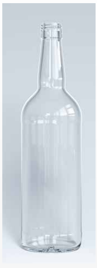
100 cl Rhum 〇 H: 314 BVP Ø: 84,7