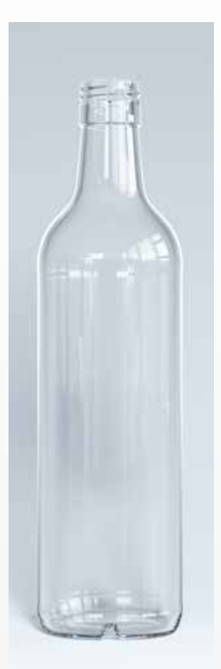
| 70 cl Vierkant ○ | H: 267,3 PP 31,5 D | Ø: 80