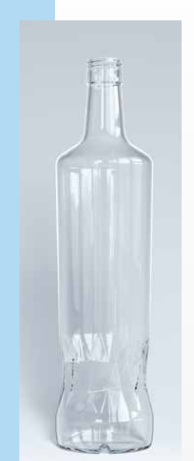
100 cl Royal 🔾 H: 326 BVP 31,5 Ø: 81,6