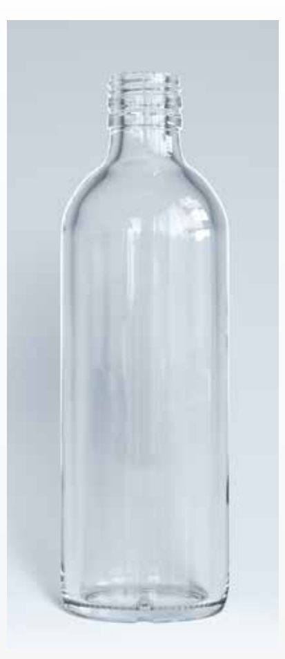
50 cl Genever ○ H: 218 PP 2 Ø: 68,2