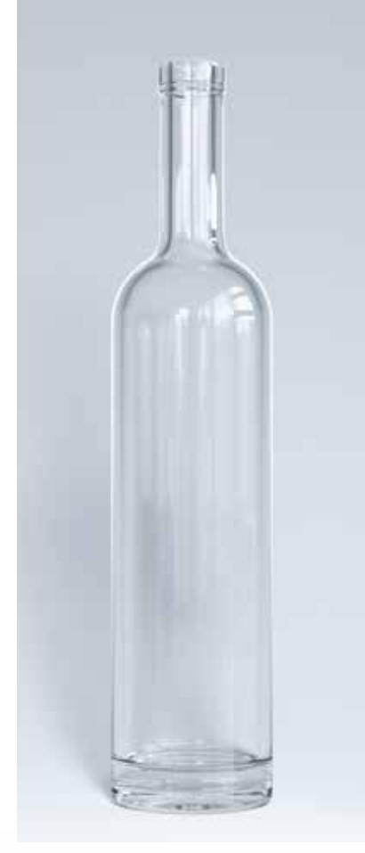
70 cl Bordolese Surpreme ○ H: 329 Cork Ø: 71,4 Int. finish Ø: 18,5

70 cl Gaasch No 1 ○ H: 314,2 BVP 31,5 Ø: 66,4