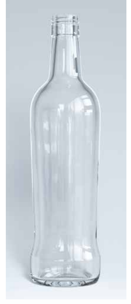
| 70 cl Bahai ○ | H: 284 BVP 31,5 | Ø: 74,3