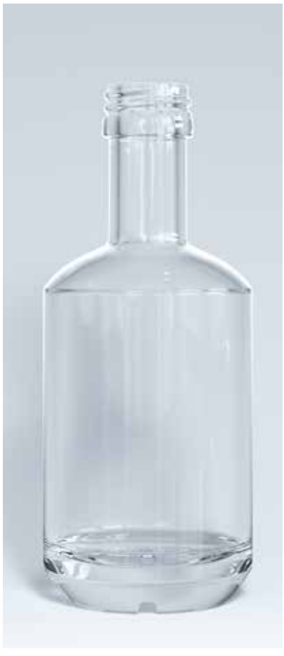
5 cl Diabolo ○ H: 101,3 BVP 18 Ø: 41,4