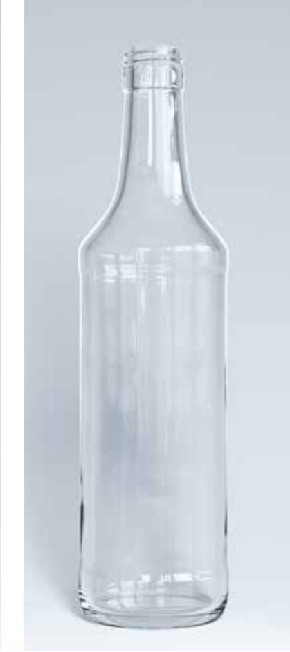
75 cl VDN Aperitif ○ H: 288 PP 31,5 [ Ø: 74,7