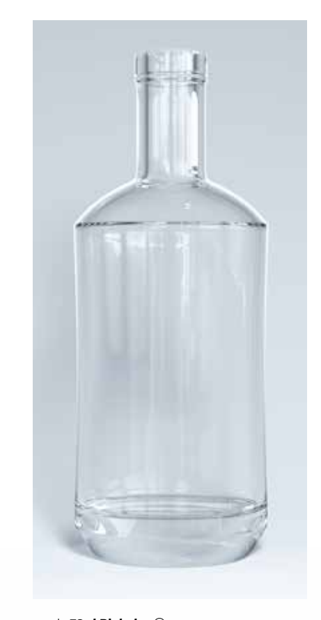
70 cl Diabolo 🔾 H: 228 Cork Ø: 90,1 Int. finish Ø: 21,5