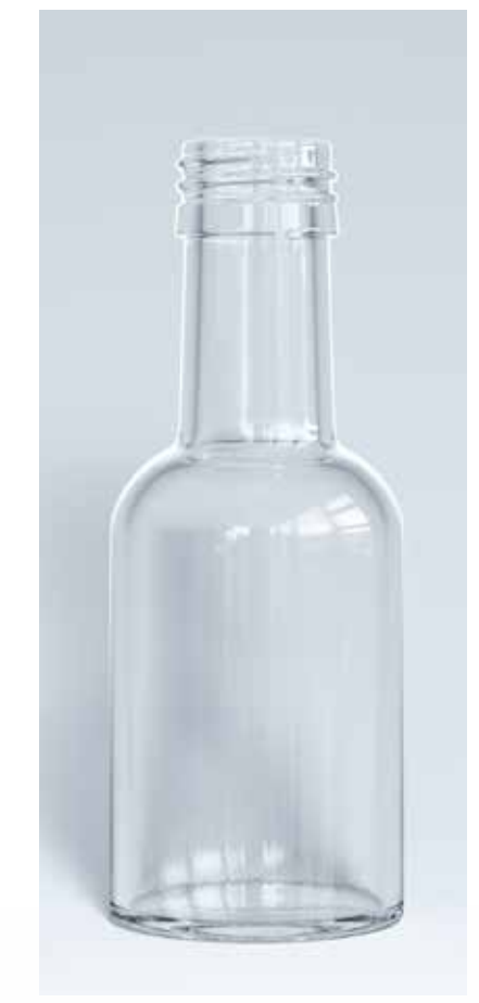
10 cl Weinflasche ○ H: 128,1 PP 28 Ø: 48,8