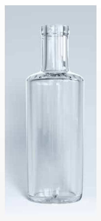
| 20 cl Oxygen ○ H: 170 Cork Ø: 57,1 Int. finish Ø: 17,5