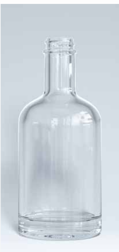
35 cl Ice O H: 177,5