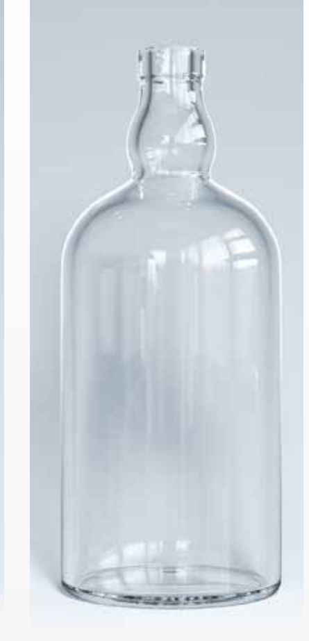
| 100 cl Loch ○ | H: 243 | Ø: 98,5 | I