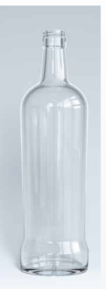
100 cl Carambola 🔘 H: 304 PP 31,5 D Ø: 86