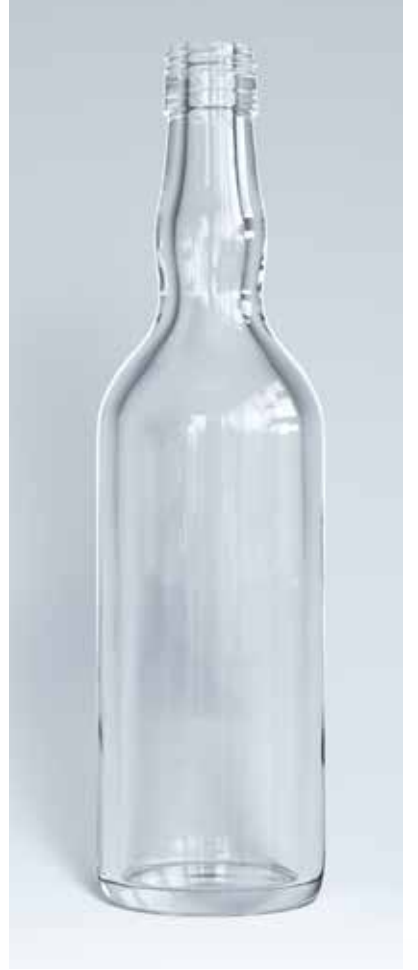
70 cl Whisky ○ H: 280,5 BVP 31,5 Ø: 75,6