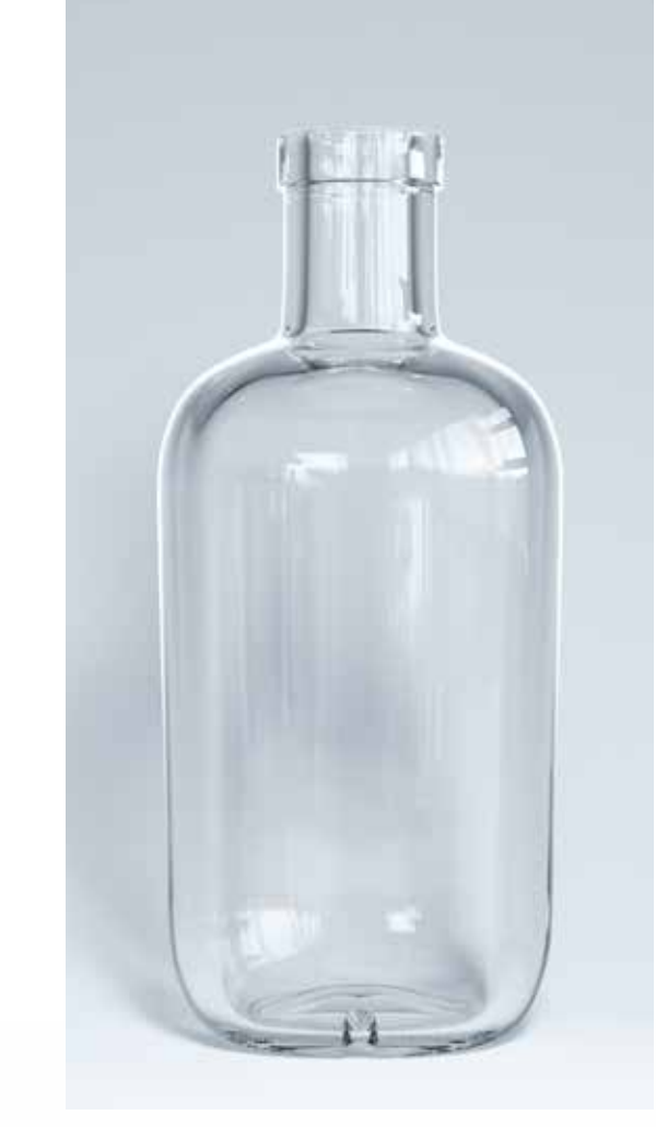
50 cl Little Zumo H: 188 Ø: 91,5 Int. finish Ø: 21