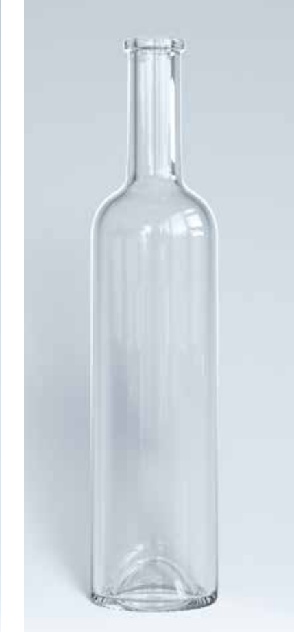
H: 282 Cork Ø: 63,7 Int. finish Ø: 18