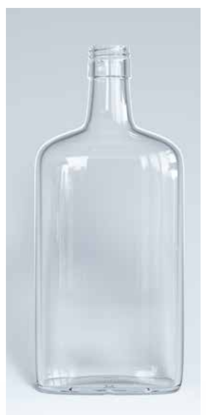
70 cl Amaretto 🔾 H: 231 PP 31,5 D Ø: 101,5 / 57,9