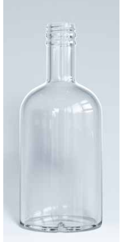
50 cl Tortuga O H: 199,4 PP 31,5 D Ø: 82,5