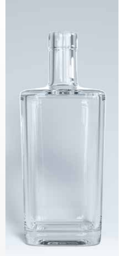
| 70 cl Colette ○ | H: 214 | Cork | Ø: 110,6 / 87 | Int. finish Ø: 17,5