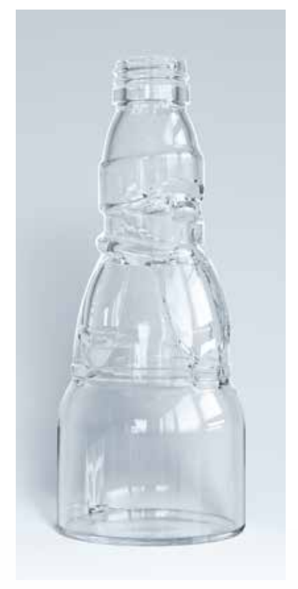
20 cl Weinachtsmann 🔘 H: 166,5 Ø: 66,5