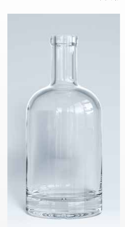
50 cl Nocturne 🔾 Ø: 85,3 Int. finish Ø: 18,5