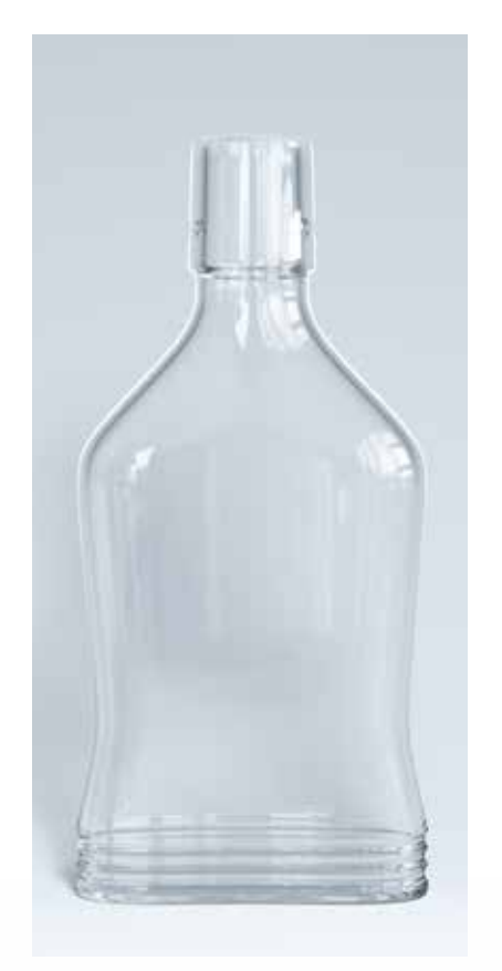
20 cl Taschenflasche 🔾 H: 180 Ø: 84 / 36,9 Patent/Bügel