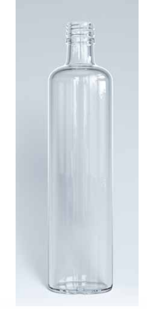
70 cl Krug ○ H: 280 PP 31,5 D Ø: 68,1