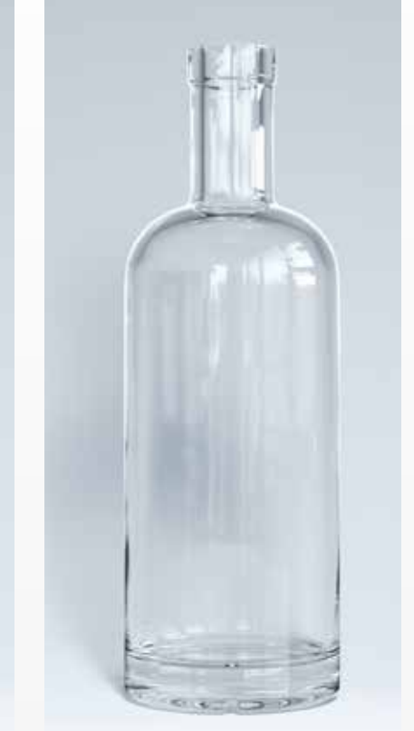
70 cl Bot. Aspect O H: 245,5 Cork Ø: 81,7 Int. finish Ø: 21,5

This overview is just a selection of the possibilities. If you did not find the perfect bottle for your purpose, please call us on tel. +49 40 731 206-0 for information about the full product line.