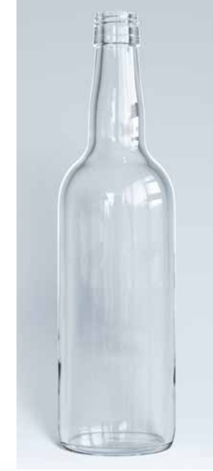
75 cl Porto Green ○ H: 285 PP 31,5 D Ø: 77,4