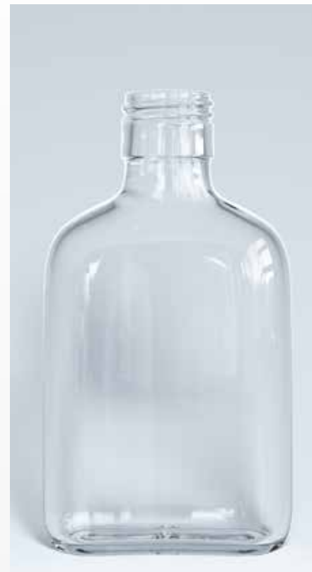
20 cl Flask ○ H: 149 PP 28 Ø: 81/39