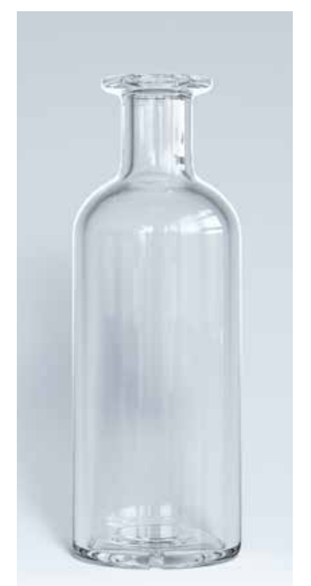
50 cl Oslo Apotheker OH: 214,7 Cork Ø: 75,5 Int. finish Ø: 21,5