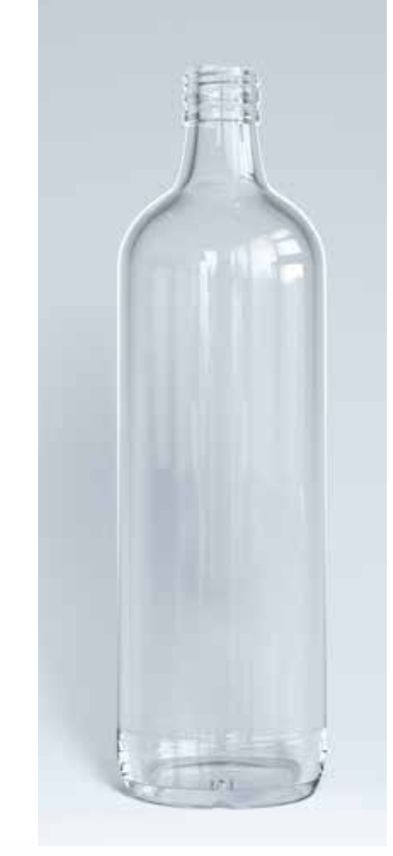
100 cl Jug Stoop \, \bigcirc \, H: 268 Ø: 81,2