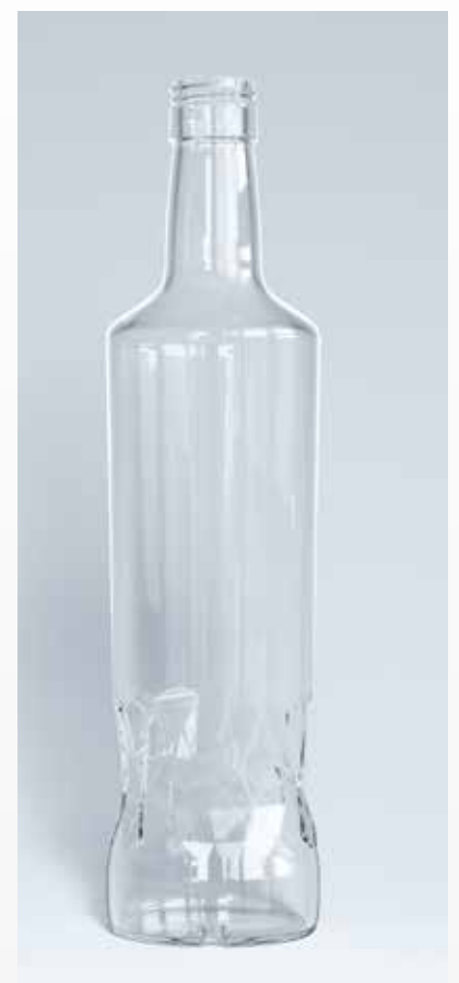
70 cl Royal O H: 294,5 BVP 31,5 Ø: 73,6