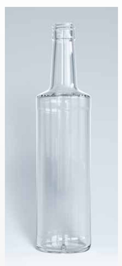
70 cl Gama O H: 295,9 PP 31,5 D Ø: 72,2