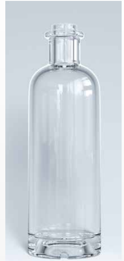
50 cl Da Eco Philos O H: 224 Cork Ø: 72 Int. finish Ø: 18,4