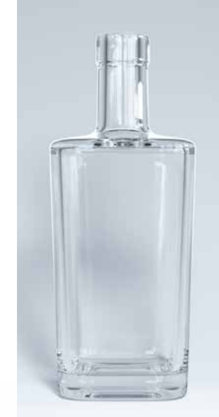
| 50 cl Colette ○ | H: 199 | Cork | Ø: 99 / 79 | Int. finish Ø: 17,5