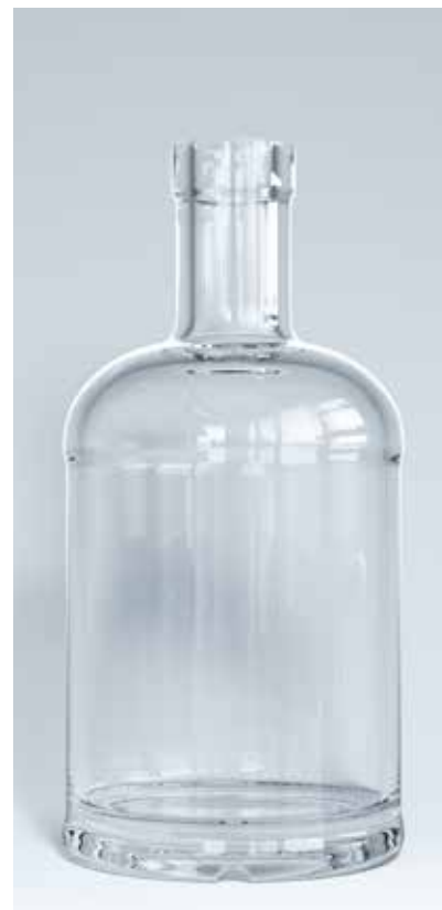
70 cl Hafenmeister ○ H: 199,1 Cork Ø: 95 Int. finish Ø: 20,5