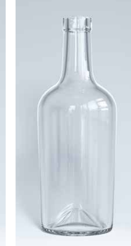
50 cl BRD Cubana O H: 218,1 Cork Ø: 80,8 Int. finish Ø: 18