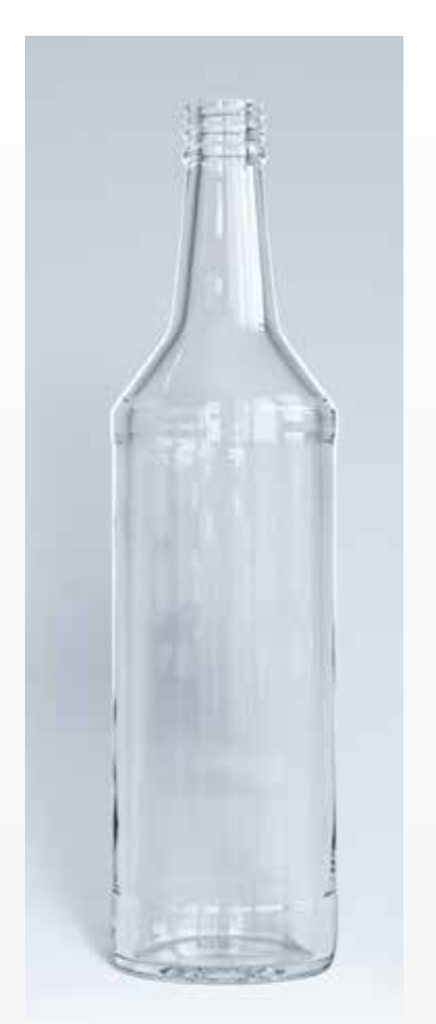
100 cl VDN Flasche 🔾 H: 315,5 PP 31,5 D Ø: 83