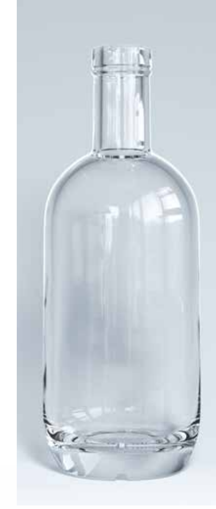
70 cl Moonea O H: 238,4 Cork Ø: 87,7 Int. finish Ø: 21,5