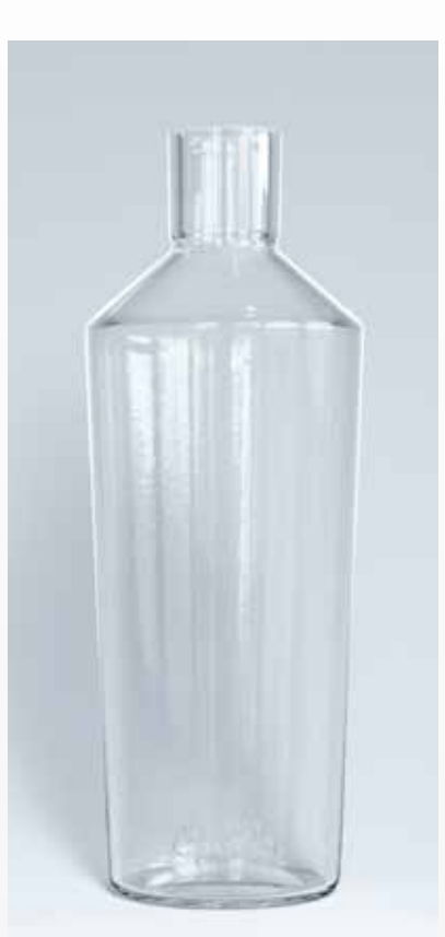
70 cl Wildly Primal O H: 233 Choker long Ø: 85,5 / 70,6