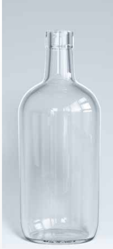
70 cl Tokio ○ H: 221 Cork Ø: 88 / 82,6 Int. finish Ø: 18